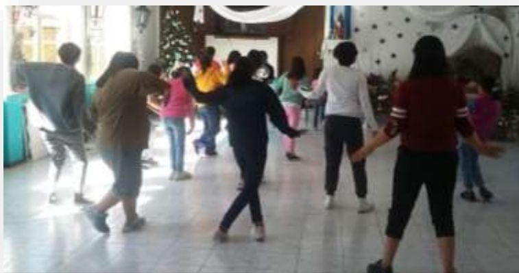
Girls doing Zumba.